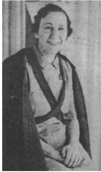
Fig. 4. Helēna Grauda (1899–1990)