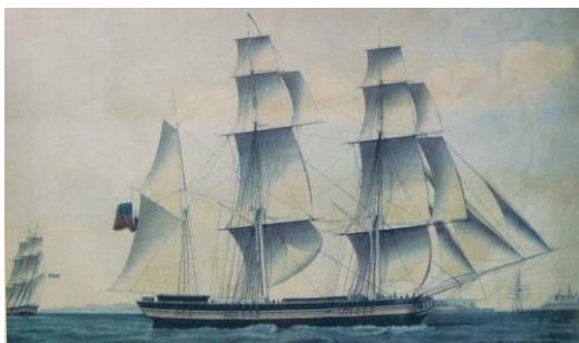
Barque Sovio (Raahe), 1860