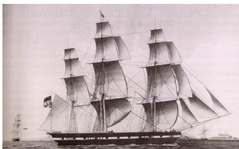
Ship Adonis, mid-1830s (Ojala 1997/GSF)

The passage through the Sound was not only recorded by the Sound Toll registers, but also by painters that provided every captain with a painted snapshot of his ship, a standardised captain's picture.